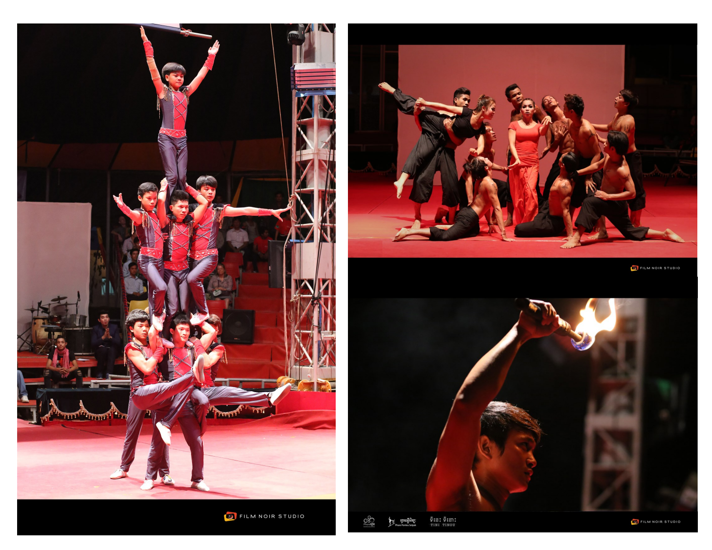
Center for Circus and Performing Arts

After 4 years of interruption, the Tini Tinou Festival was focused Cambodian artists in 2014. The show lasted 1h30 and was divided into two performances, first by the troupe of the Center for Circus and Performing Arts who have just returned from spending 2 years in China to train in the circus arts. Their amazing skills and beautiful costumes made an extraordinary impression on the crowds. The second part was the dynamic and highly visual Eclipse show by Phare Performing Social Enterprise troupe. Thank you to ANZ Royal Bank and Smart who sponsored the event and made it possible.