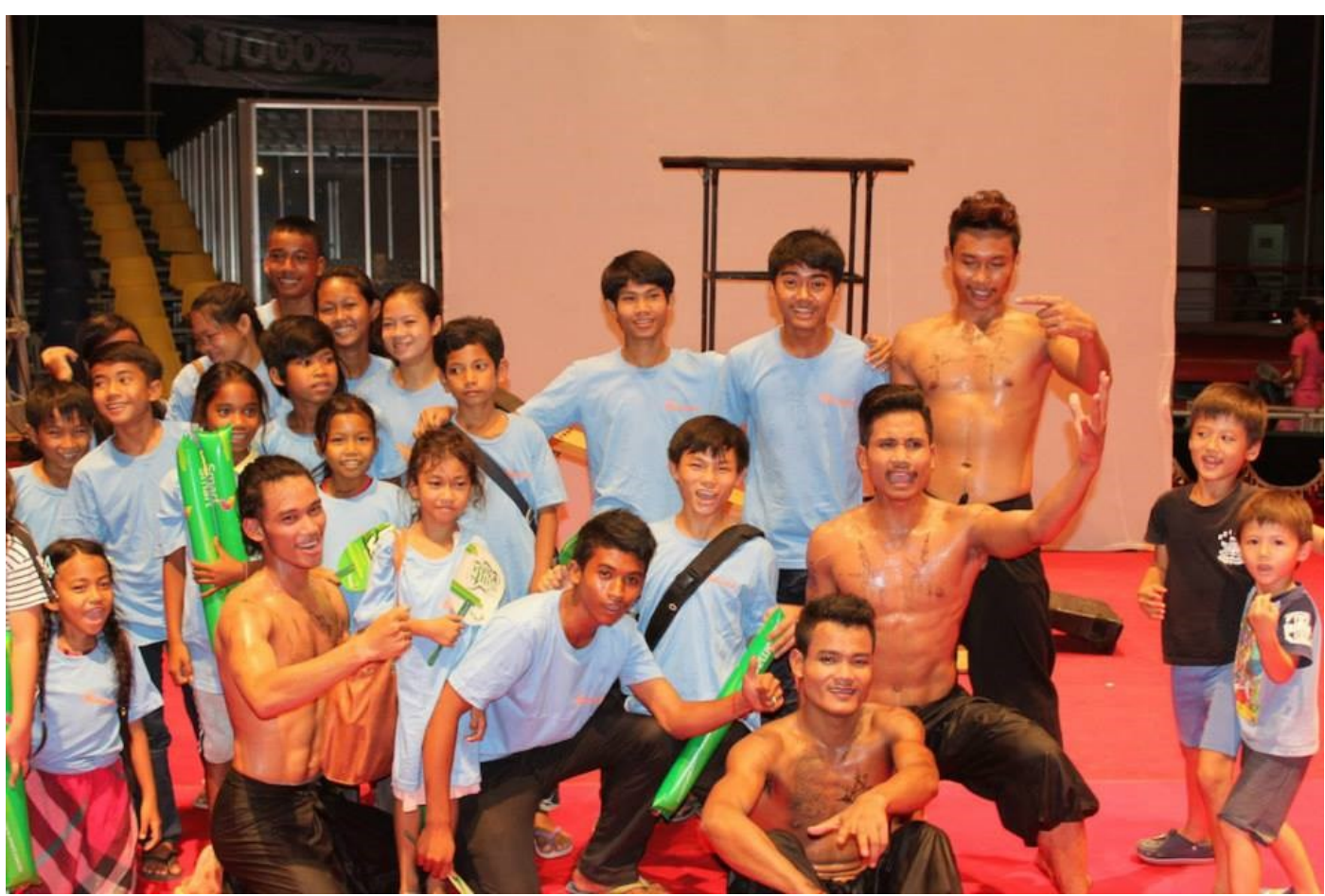
Children from Taramana with the stars of Eclipse